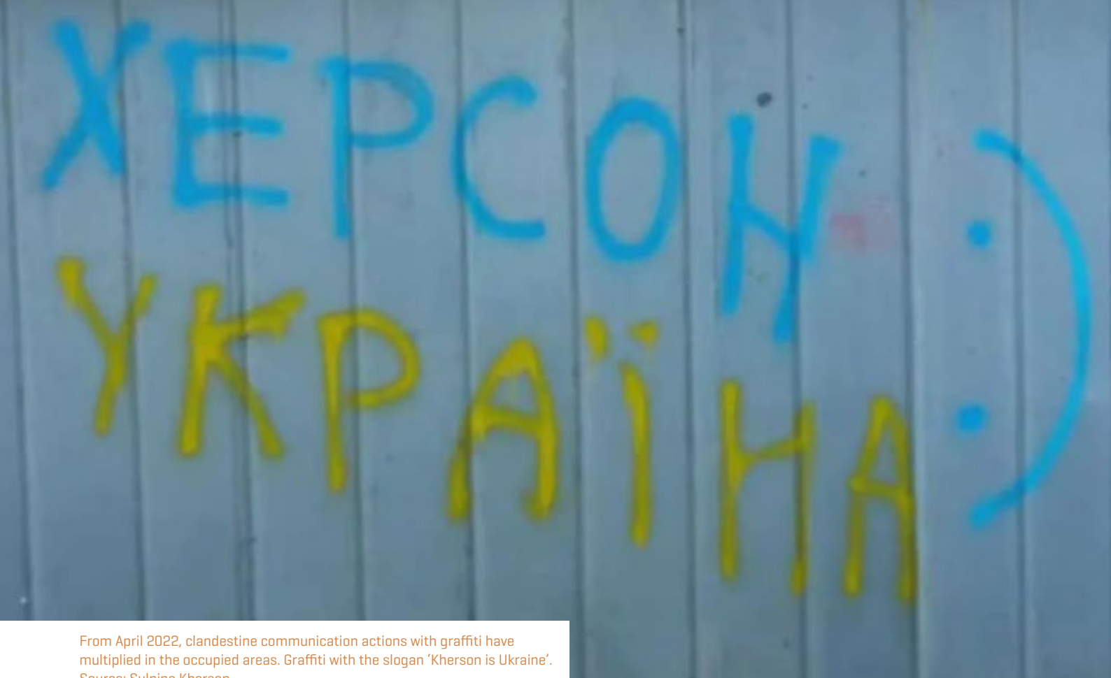
From April 2022, clandestine communication actions with graffiti have multiplied in the occupied areas. Graffiti with the slogan 'Kherson is Ukraine'.