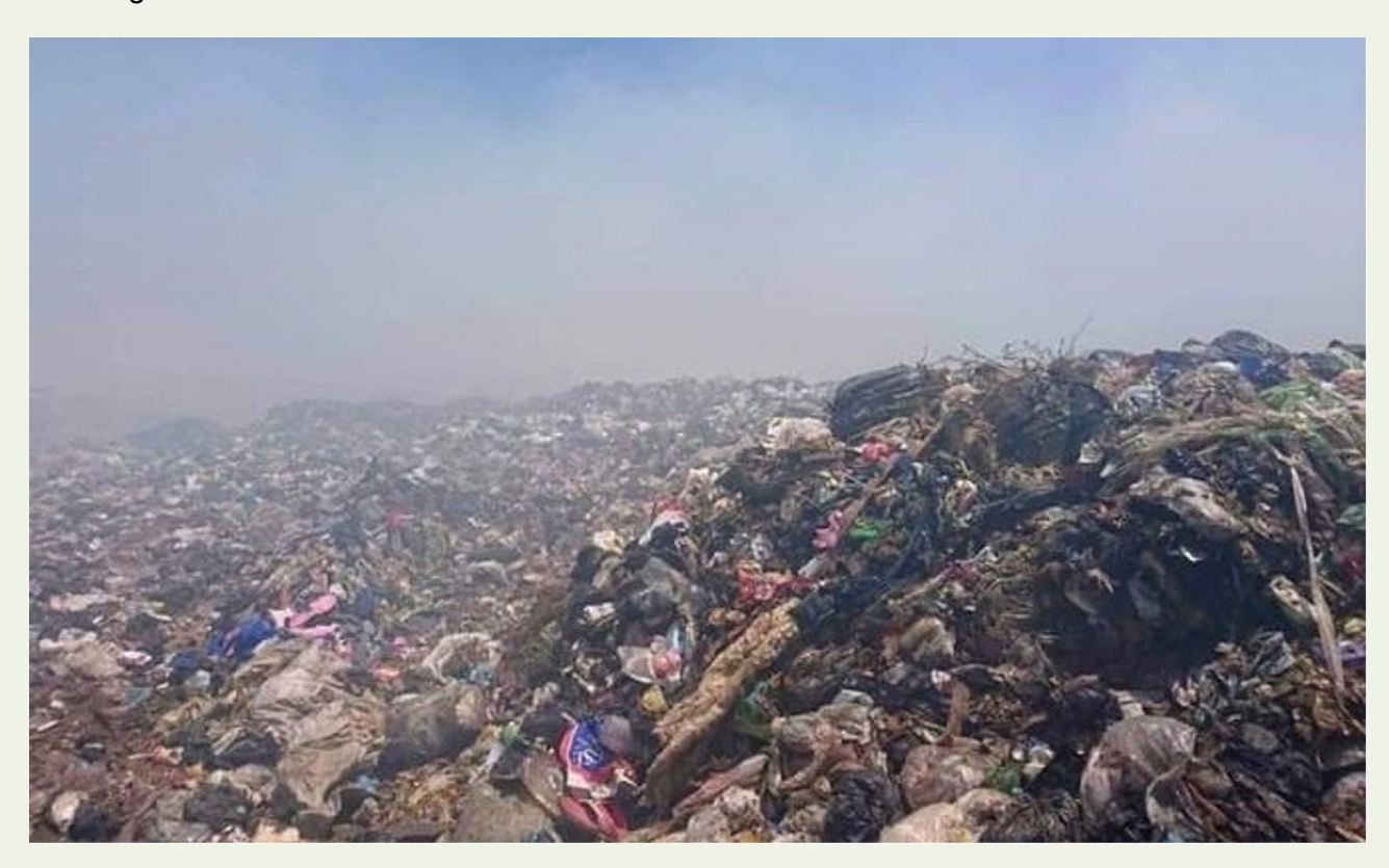
The burning mountains of garbage in al Bassa landfill.

It also emphasized that the new landfill's operation closes the file of environmental pollution caused by the Al-Bassa landfill, which has been a source of concern for the people of Latakia and the government in recent years due to the end of its design life and the incineration of waste and smokes resulting from it.<sup>46</sup>