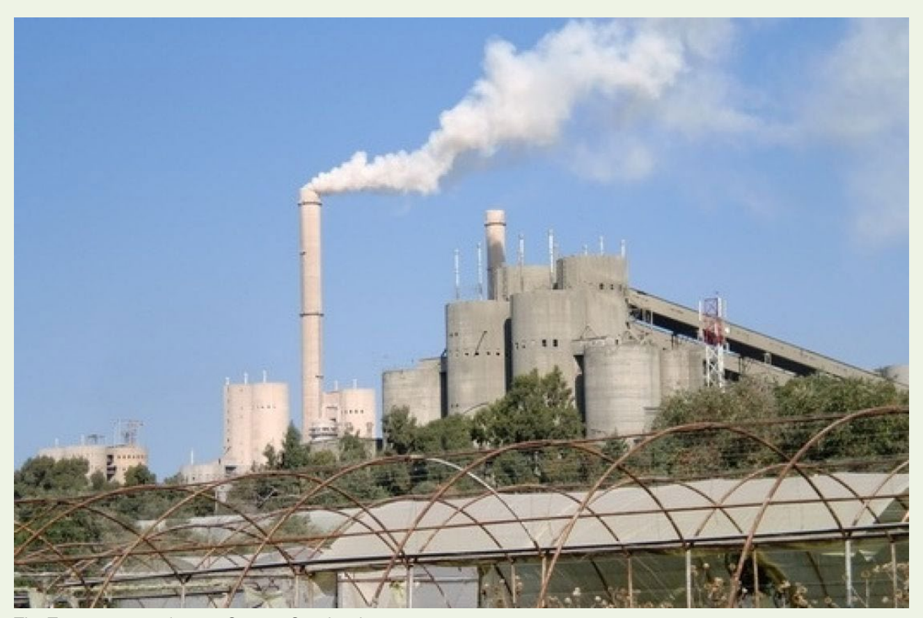
The Tartous cement factory.

The people of the affected areas demanded to relocate the factory and use its location for residential and tourist installations. They stressed that the location of the factory has a lot of tourist potential, and the building of this factory was hampering it. <sup>49</sup> Despite all the complaints to the authorities, some people from Husayn Al-Baher village said that they have been promised a solution to this situation for 3 decades while the authorities promised to install smoke filters, but it was never implemented. <sup>49</sup>