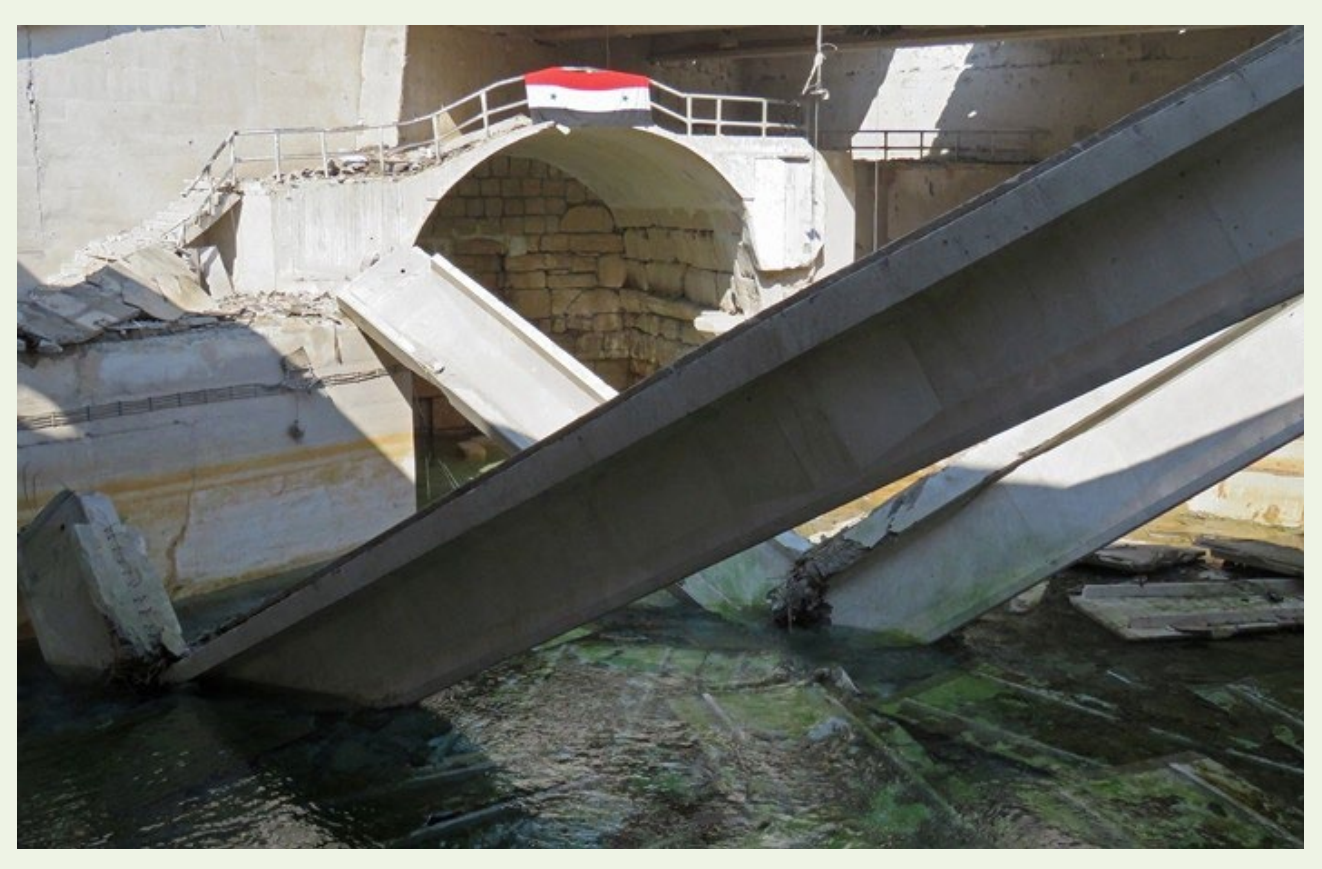
The water pumping station located in Ain al-Fijeh, on the outskirts of Damascus, suffered damage during the battle in the Wadi Barada area after government forces recaptured the area from the opposition in January.

Studies have found high levels of chromium in the sediments and soil adjacent to the Barada River, as well as high levels of copper and nickel from electroplating industries and titanium from polishing and tanning industries waste in the industrial areas near the river. A study in 2002 revealed that the river's BOD (biochemical oxygen demand) levels were above standards downstream of the river, likely due to the contamination with domestic water waste from the city being dumped into the river.<sup>10,11</sup>