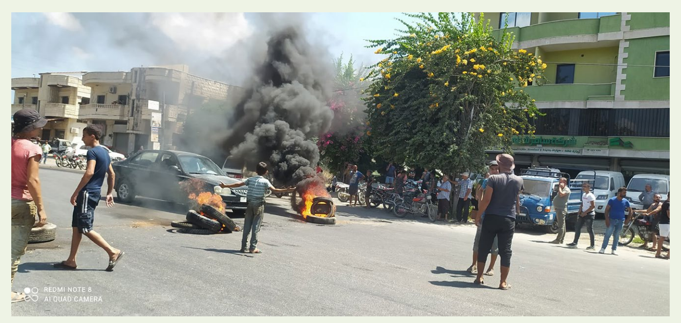
People protesting the ongoing operation of Wadi Al-Hudda by blocking the road to the landfill to prevent trash trucks from accessing it.