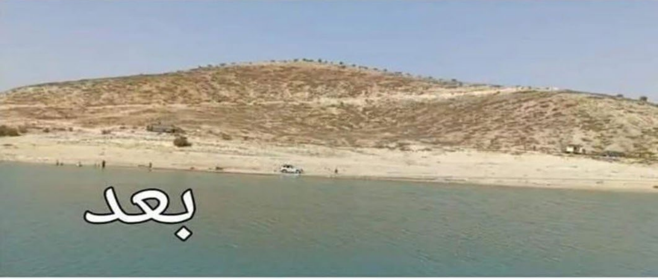
Maydanki lake forest before (upper part) and after (lower part) the deforestation.