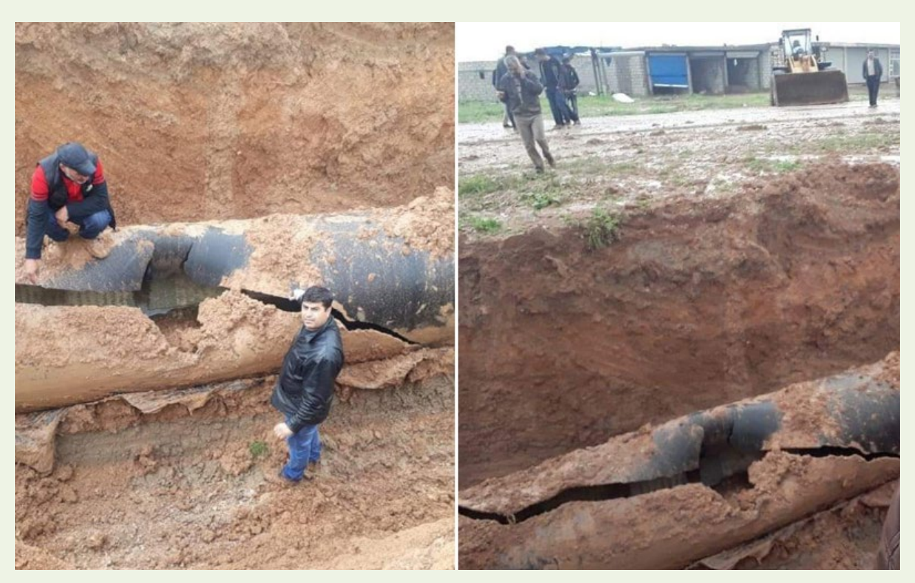
The main water pipe of the Allouk water station was damaged due to the bombardment with artillery by Turkey and its allies.

In Syria's Al-Hasakah, a protest was organized by the General Activities Committee of the Educational Complex to denounce Turkey's cut-off of water supply from the Allouk Water Station. The local community and civil society groups in Al-Hasakah and Kobani joined the opposition. Multiple organizations and international entities have called for intervention and compliance with water-sharing rules. The United Nations has emphasized the need to restore water flow and protect civilians while delivering humanitarian aid.<sup>29,30,31</sup>