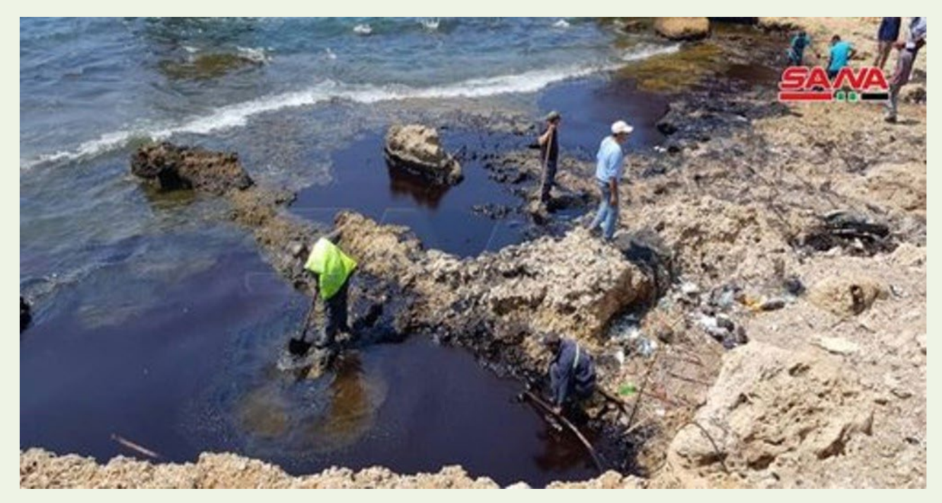
Decontamination operations extend to the shores of Jableh.