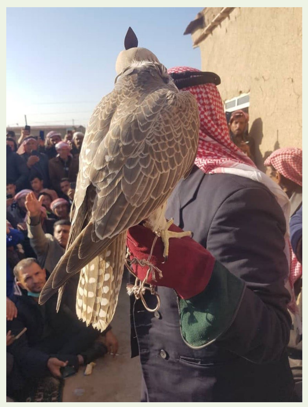
A falconer presenting his valued hunting capture.